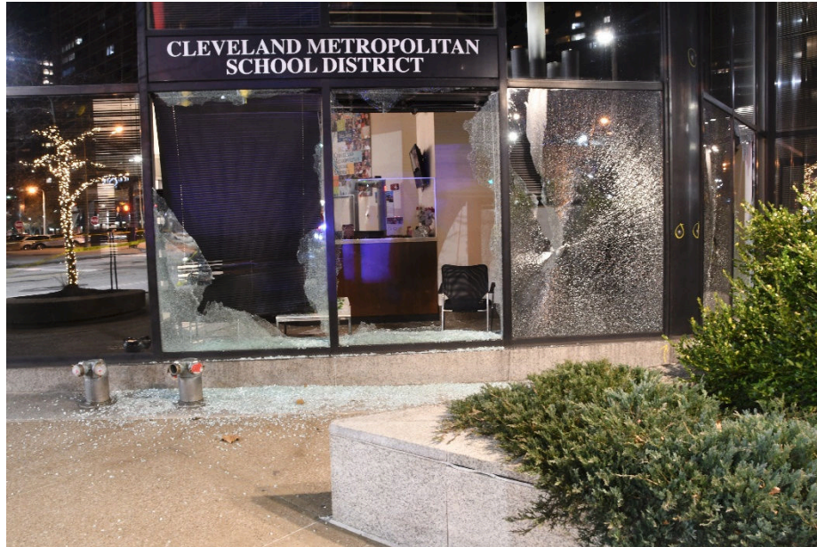
Figure 3, Overall Photograph (1111 Superior Ave)

Officer Involved Critical Incident – Superior Avenue/E. 12 th Street, Cleveland, Ohio 44114