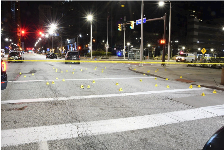
Figure 1, Overall Photograph (NE Corner)

Officer Involved Critical Incident – Superior Avenue/E. 12 th Street, Cleveland, Ohio 44114