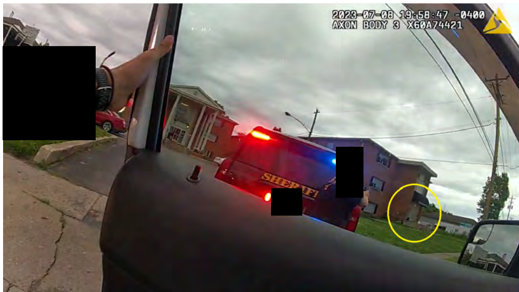
██████████ BWC 1: ██████████ ██████████ arriving on scene and exiting cruiser

██████████ then advised "Male Black, black shirt" to ██████████ ██████████ and Sgt. Goodrich ( See Photo ██████████ BWC 2').