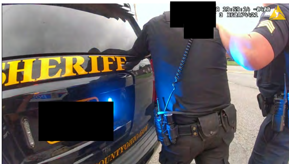
██████████ BWC 2: ██████████ ██████████ advising CPD officers he believed Lindsey had been shot and describer Lindsey as "Male Black, black shirt"

██████████ and Sgt. Goodrich walked along the west side of the building and confronted an African American male wearing a dark shirt and jeans at the northwest corner of the building (See Photo ██████████ BWC 3'). That subject, later identified as maintenance, had his hands up and