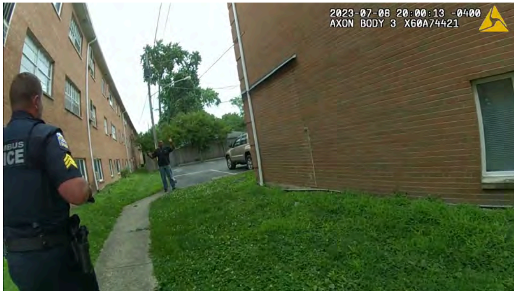
[REDACTED] BWC 3: Sgt. Goodrich and [REDACTED] [REDACTED] encounter maintenance worker at northwest corner of building

advised officers "Everybody went to the front". Sgt. Goodrich inquired about a "back door" and the maintenance man advised the "cops" came out the back door and went towards the front of the building and identified himself as maintenance. At 20:00:29 hours, a single gunshot can be heard and CPD [REDACTED] [REDACTED] [REDACTED] who was running along the west side of the building can be seen looking behind him towards the front of the building in response to the gunshot (See Photo [REDACTED] BWC 4'). Maintenance then advised "they" are inside the building. Dispatch can be heard on a radio stating "Be advised, county is advising that one of the suspects... at least one suspect went into an apartment. I don't know apartment number". At 20:00:41 hours, Sgt. Goodrich can be heard telling officers "Did you guys hear that? County guy exchanged fire up there" as he pointed towards [REDACTED] [REDACTED]'s cruiser ( See Photo [REDACTED] BWC 5').