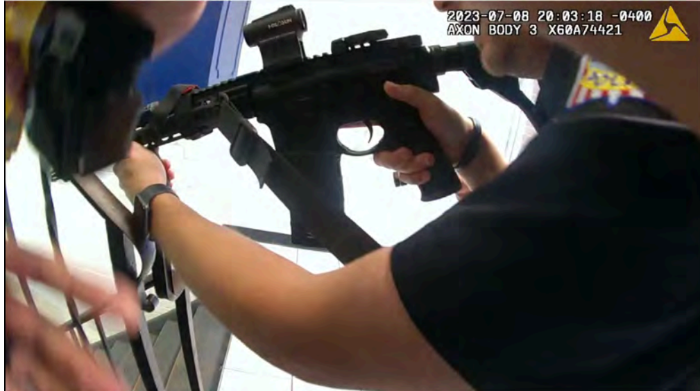
██████ BWC 10: ██████ ██████ telling officers he is going to deploy Taser against Lindsey