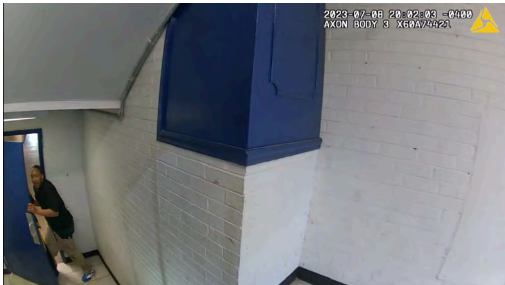
██████ BWC 6: ██████ ██████ encountering Lindsey at front entrance to lower-level hallway

This document is the property of the Ohio Bureau of Criminal Investigation and is confidential in nature. Neither the document nor its contents are to be disseminated outside your agency except as provided by law – a statute, an administrative rule, or any rule of procedure.