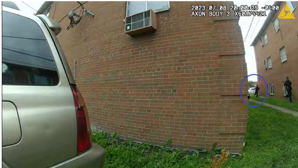
██████████ BWC 4: Single gunshot audible and ██████████ ██████████ seen turning towards direction gunshot originated