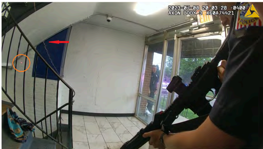
██████ BWC 11: After the gunfire coming from the lower-level ceased, ██████ ██████ can be heard uttering "Fucking eh" and the laser sight and probe leads for Taser visible

This document is the property of the Ohio Bureau of Criminal Investigation and is confidential in nature. Neither the document nor its contents are to be disseminated outside your agency except as provided by law – a statute, an administrative rule, or any rule of procedure.