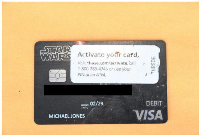
Figure 1: Evidence Item #1

On Friday, August 23, 2024, at 0900hrs, SA McClintock arrived at the above address. The vehicle was photographed as found. The vehicle was examined for items of suspected evidence. On the center floorboard was a plastic container with a credit card, cigarillos, loose tobacco, a lighter and a folded lottery ticket. The credit card was collected and labeled Evidence Item #1 . The folded lottery ticket was collected and labeled Evidence Item #4 .