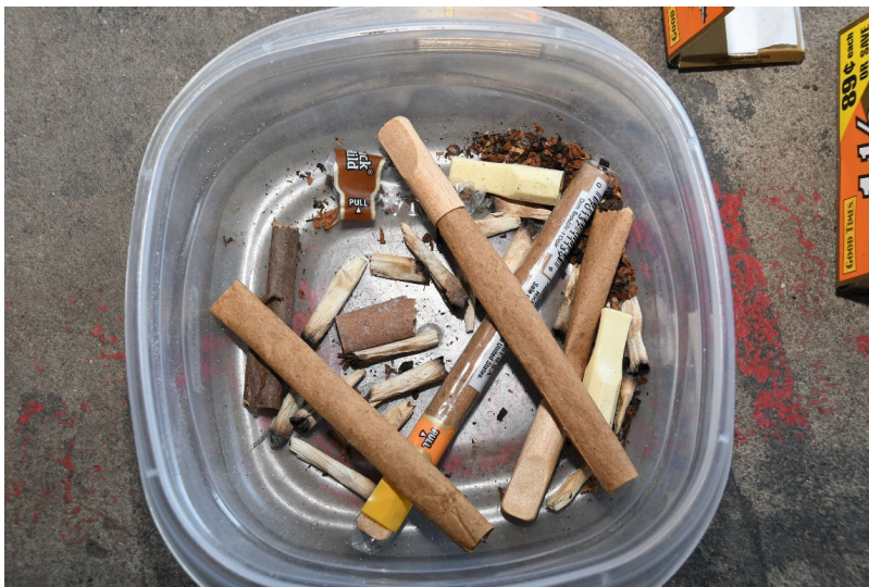
Figure 5: Evidence Item #5

Throughout the cabin of the truck were packages of rolling papers, cigarillos, loose tobacco, and the remaining pieces of partially smoked rolling papers. These were collected as one item and labeled Evidence Item #5 .