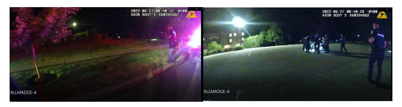
Figure 1 Figure 2