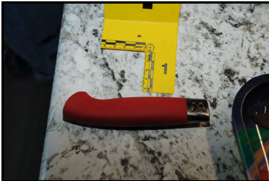
(Item 1: red knife handle from kitchen countertop)

This document is the property of the Ohio Bureau of Criminal Investigation and is confidential in nature. Neither the document nor its contents are to be disseminated outside your agency except as provided by law - a statute, an administrative rule, or any rule of procedure.