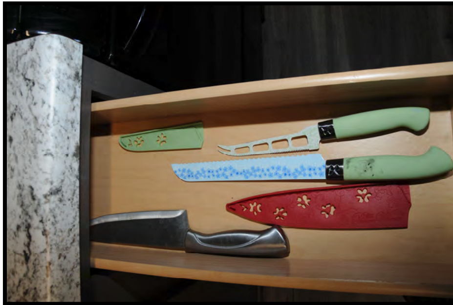
(Knives in kitchen drawer)

Officer Involved Critical Incident - 2469 Kimberly Pkwy. E, Columbus, OH 43232 (L)