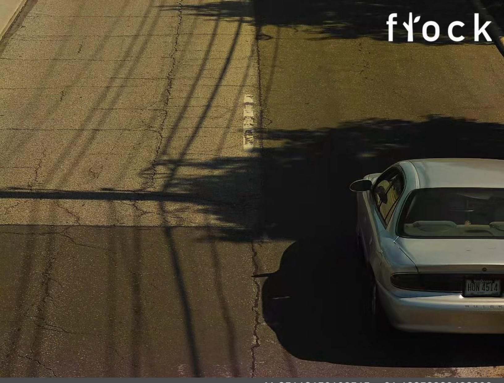
Brecksville OH PD-#02 Brecksville Rd SB @ Sprague 6/22/2022 16:52:42 EDT