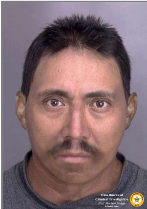
Artist’s Rendering—Not Actual Image

Clothing: Gray button up shirt, women’s size 8 tan pants, and one brown shoe (size 10) with the brand name of “Earth Shoe.”