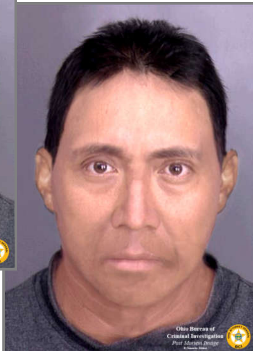
Ohio Bureau of Criminal Investigation Post Mortem Image