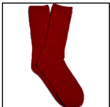
Not actual image