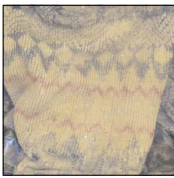
Fabric from knit sweater