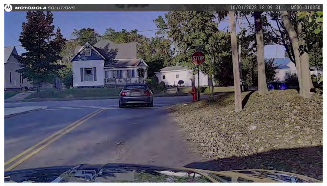
Officer Phillips' Cruiser Camera capturing stop bar and turn signal violations.

Still Images from Cruiser & Body-Worn Camera Review: