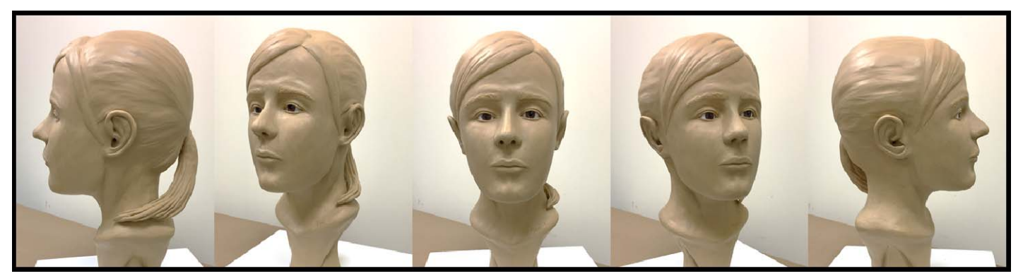
*Hairstyle and eye color are estimations and should not be considered significant makers for identification.

An Ohio BCI forensic artist created the pictured facial reconstruction of the female, who was likely a Caucasian female between 15 and 30 years old at the time of her death. She had brown hair and likely stood between 5'3" and 5'9" tall and weighed between 100 to 150 pounds. Her teeth were well cared for and had no obvious dental work or fillings.