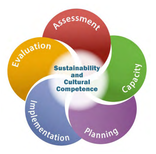
SAMHSA's Strategic Prevention Framework (SPF)