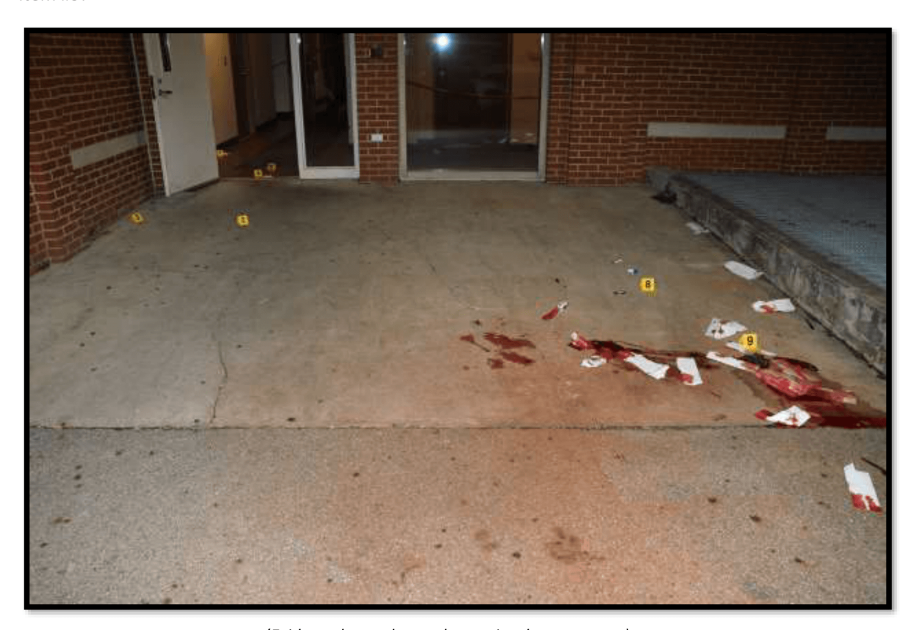
(Evidence located near the service door entrance)

A firearm was located on the ground, by the grate, near the pool of blood. The firearm, a Ruger, LCP II, .380 semi-automatic handgun had a serial number of 380196961. The firearm had one cartridge in the chamber and one cartridge in the magazine. The firearm, cartridges, and magazine were all collected as item #9.