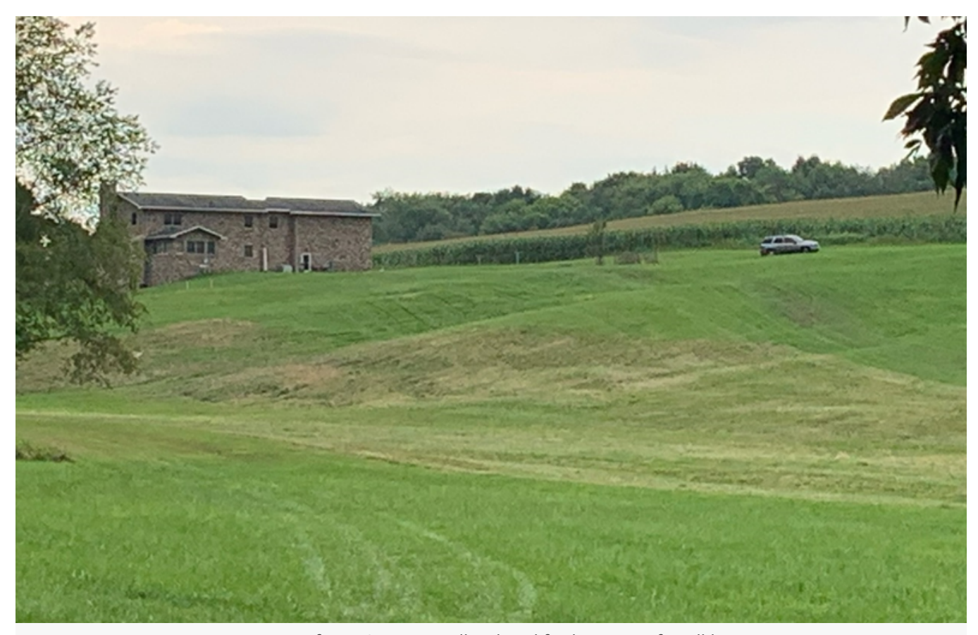
Rear view of 15159 Monroe Mills Rd. and final position of Trailblazer.