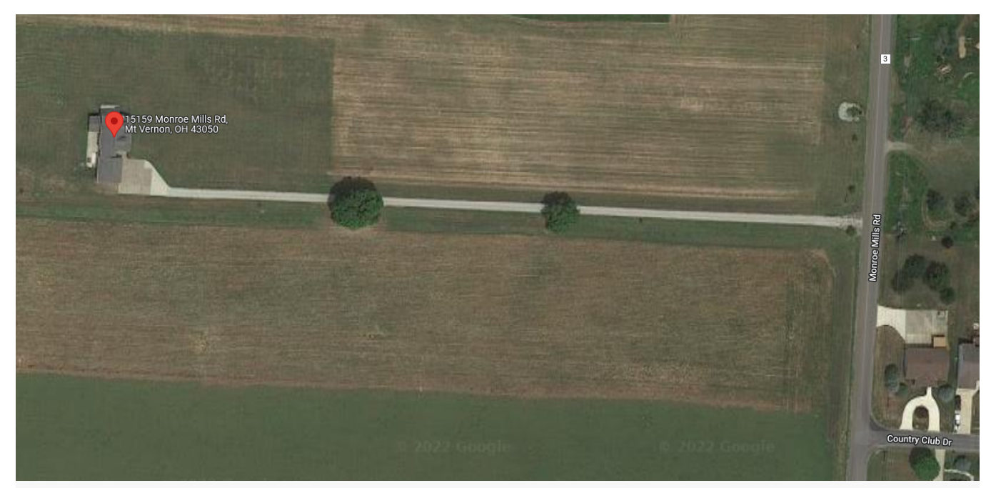
Overhead Reference Map of 15159 Monroe Mills Rd.

Ofc. Glennon said the rear hatch of the Trailblazer was open/up, as if the subject(s) had been loading or removing items from the vehicle. Glennon said the Bearcat attempted to block the Trailblazer by placing its front bumper on the driver's side headlight of the Trailblazer at an angle.