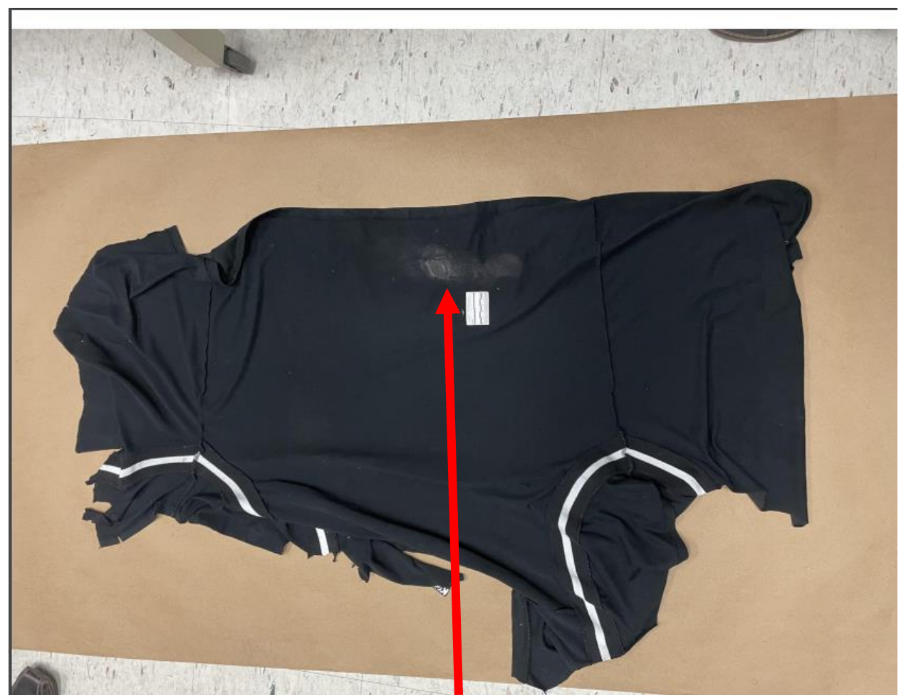
Figure 5, showing black underwear worn by Zoran, with staining and a single defect in the top center back area of the garment.