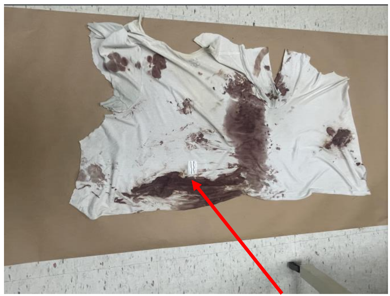
Figure 3, showing Zoran's white t-shirt with red and brown staining and a visible defect in the center lower back area.

Officer Involved Critical Incident - 500 West Hopocan, Barberton, OH 44203