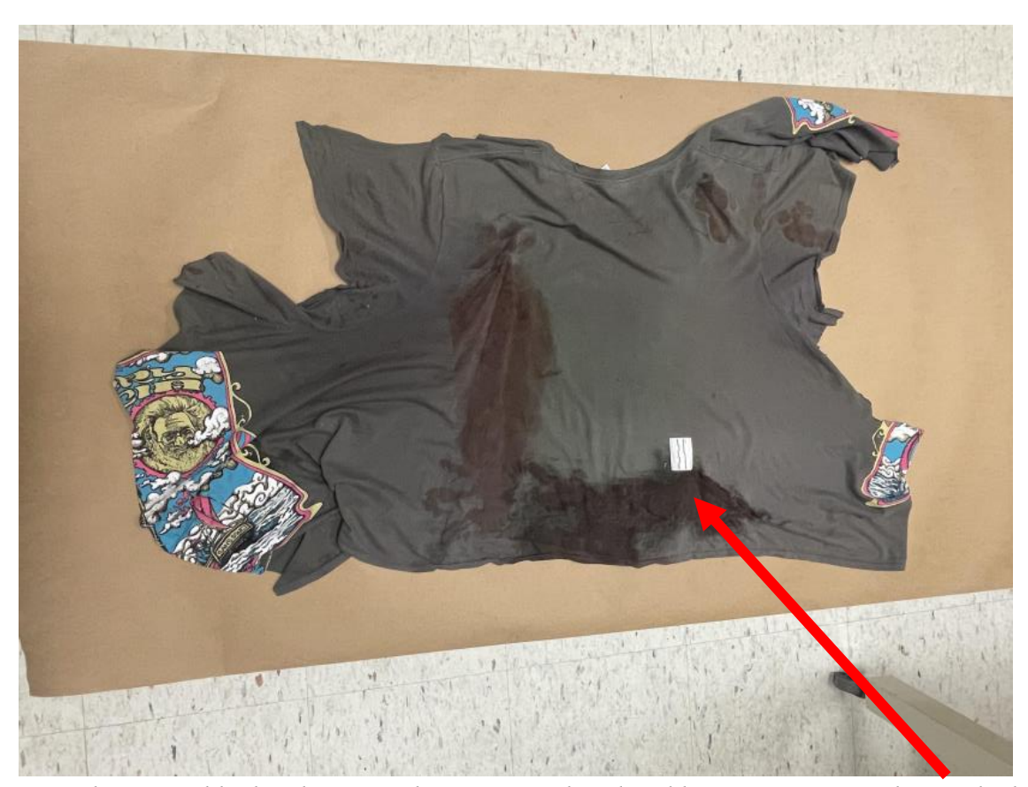
Figure 4, showing a black t-shirt worn by Zoran, with red and brown staining and a single defect in the lower center back area of the garment.

Officer Involved Critical Incident - 500 West Hopocan, Barberton, OH 44203