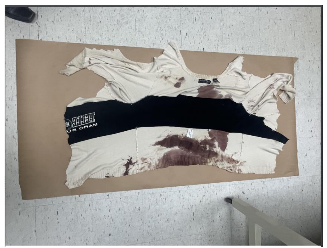
Figure 1, Zoran's sweater with red/brown bloodlike staining and a single defect present in the center lower back of the garment.

2022-2918 Officer Involved Critical Incident - 500 West Hopocan, Barberton, OH 44203