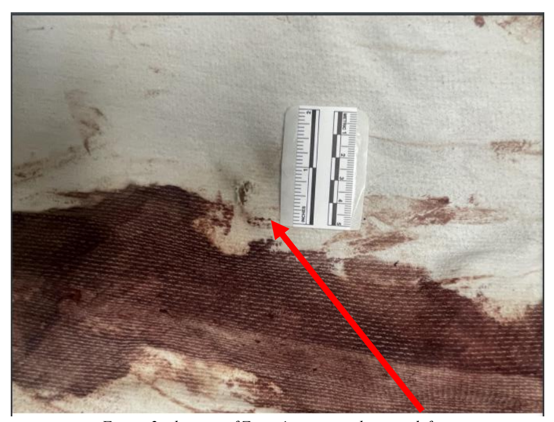
Figure 2, close up of Zoran's sweater showing defect.

2022-2918 Officer Involved Critical Incident - 500 West Hopocan, Barberton, OH 44203