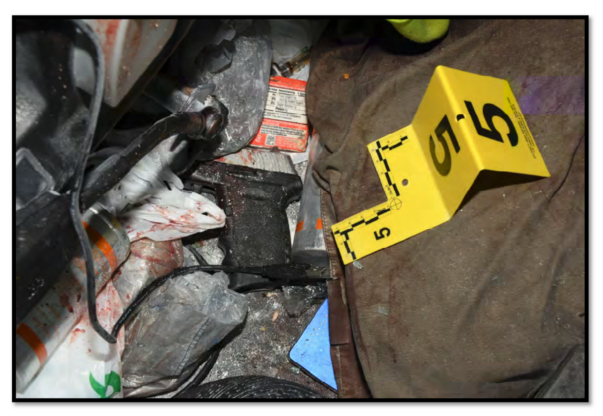
Image 2 – Item 5, a SCCY handgun found between front seats on the floorboard

Inside the truck, a two-toned SCCY handgun (serial number C232709), with an empty magazine was observed on the floorboard between the driver and passenger seats amongst debris and was collected as item 5. There were no cartridges in the magazine nor the chamber of the gun. Three FC cartridges (items 6 and 7) and one 9mm FC casing (item 8) were located on the driver floorboard. A hammer with suspected blood on it (item 11) was also located on the driver floorboard. The hammer was reportedly used by to initially defend himself against Rodney and Elaine. A fired projectile (item 9) was collected from the semi-truck's rear cabin, on the bed. An additional projectile was located on the passenger side exterior step, and was collected as item 10.