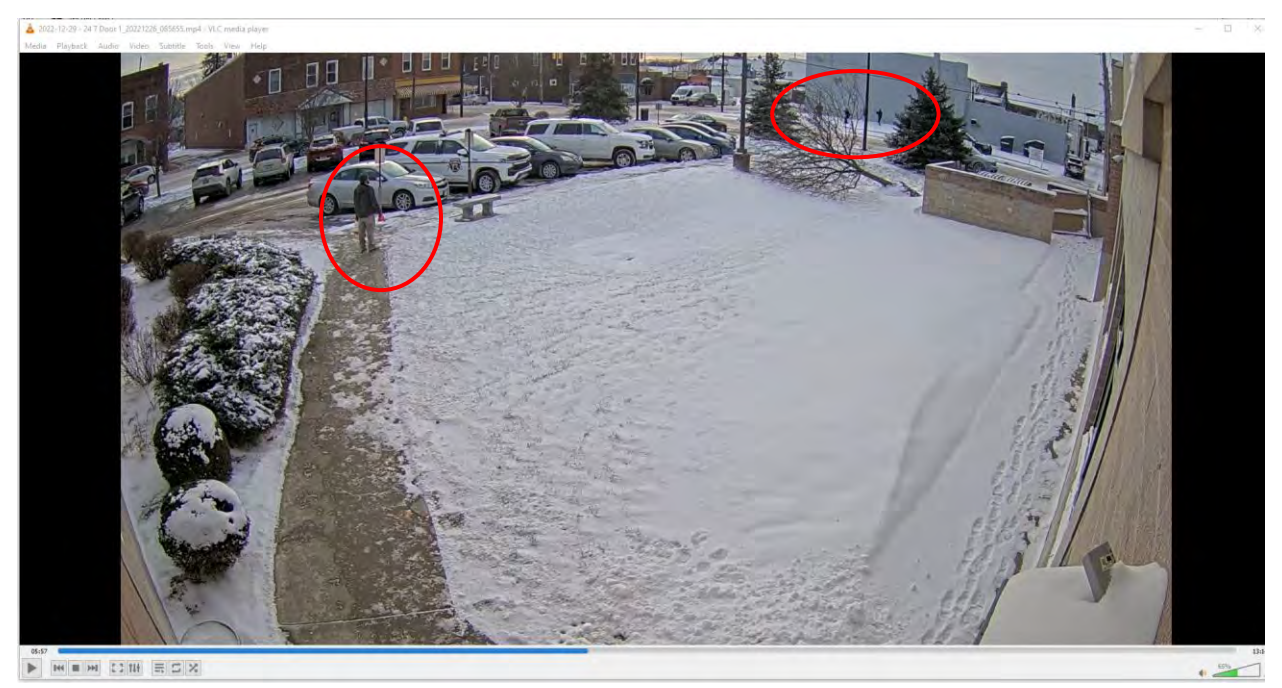
YMCA 24 7 Door - Still 1

The third recording titled: 24 7 Door 1_20221226_090548, showed the interaction between Zoran and the Barberton Police to the rear of the Lake Anna YMCA property.