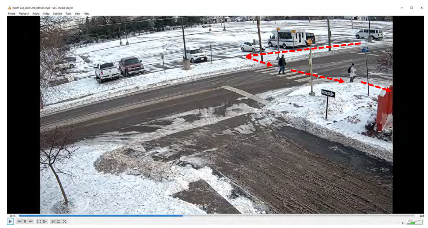
YMCA North Lot Still 2

Officer Involved Critical Incident - 500 West Hopocan, Barberton, OH 44203