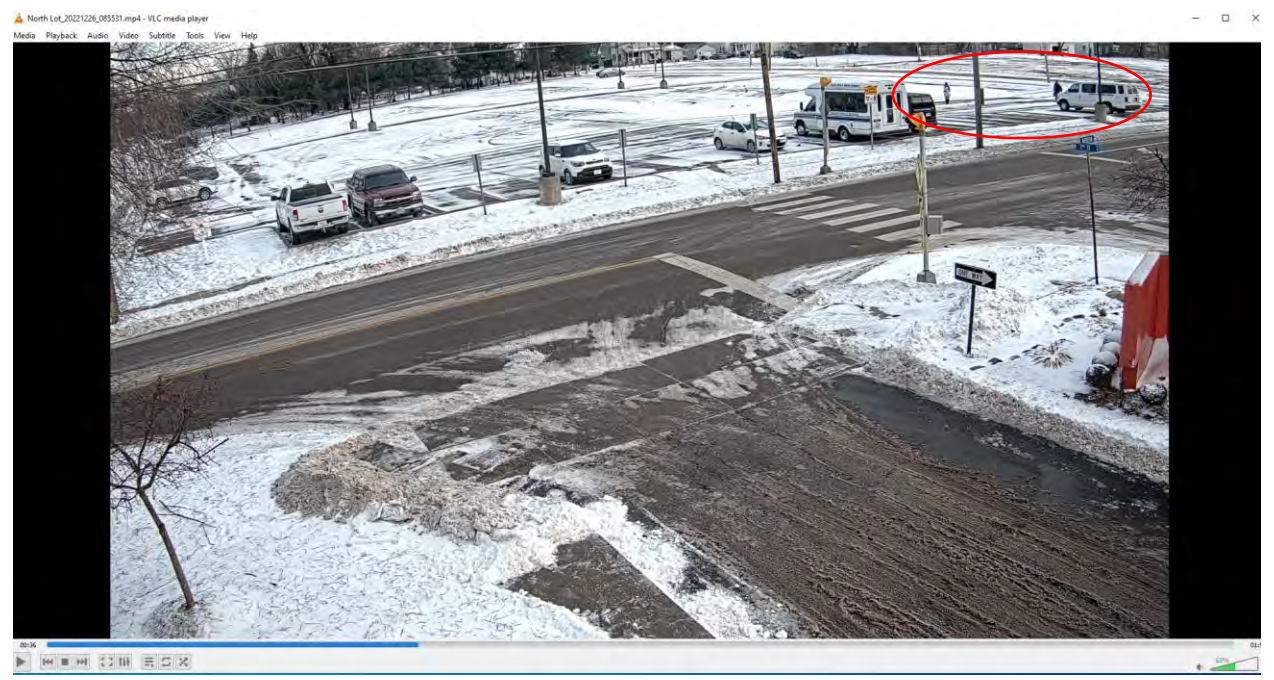
YMCA North Lot Still 1

The first recording, titled: North Lot_20221226_085531 , captured Zoran as he walked towards the facility from the north to the south.