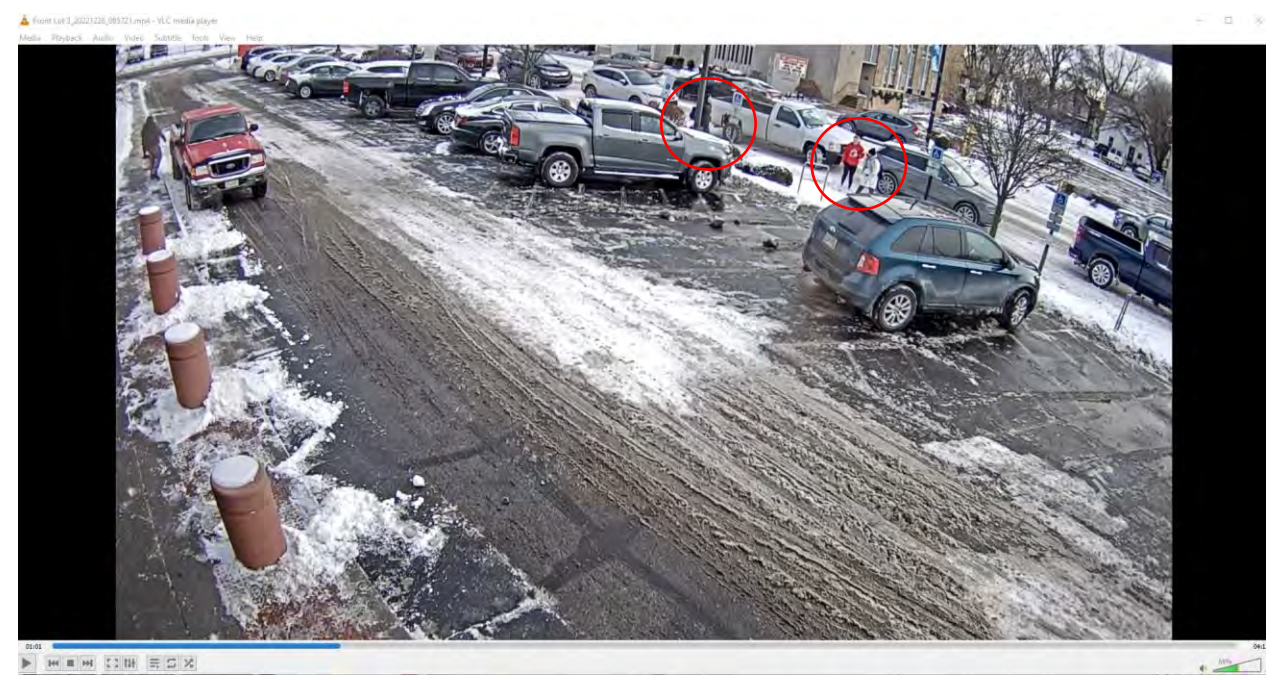
YMCA Front Lot Still 1

The second recording titled: Front Lot 3_20221226_085721 , captured Zoran as he walked towards and past the main entrance of the Lake Anna YMCA.