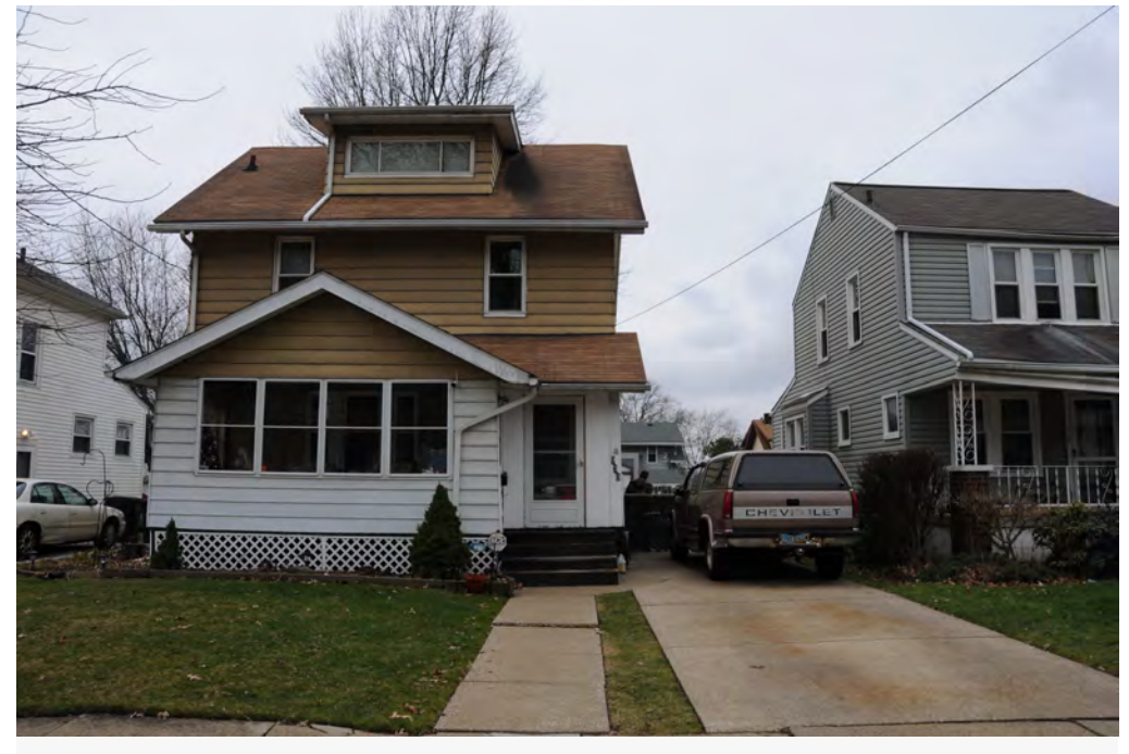
Figure 1, Overall photograph - 930 Dan St.

With Franklin's verbal permission, SA Boerner photographed the exterior of the residence and the interior second floor crawl space used to gain access to the interior side of the roof (Figures 2–4). SA Boerner located the reported truss struck by the suspected projectile and determined that the projectile could not be removed from the inside without cutting into the truss and thus impacting the integrity of the roof. SA Boerner assessed the roof from the outside and determined that to locate the suspected projectile a hole would have to be cut into the roof and part of the truss would have to be removed to collect the suspected projectile. It was at this time that SA Boerner determined that the potential damage to the roof caused by removing the suspected projectile outweighed the forensic value of collecting the suspected projectile. Franklin was advised of the same and appeared to agree with the assessment.