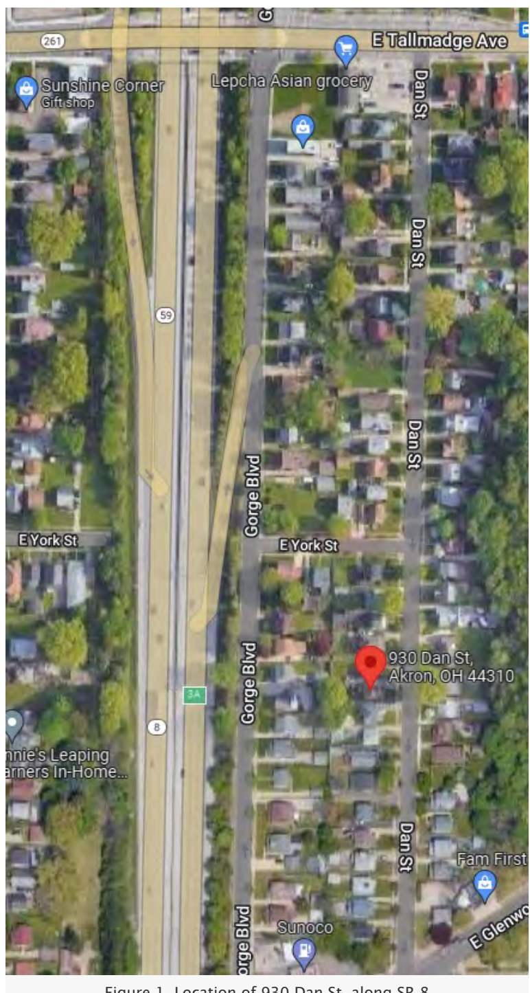
Figure 1, Location of 930 Dan St. along SR 8

This document is the property of the Ohio Bureau of Criminal Investigation and is confidential in nature. Neither the document nor its contents are to be disseminated outside your agency except as provided by law - a statute, an administrative rule, or any rule of procedure.