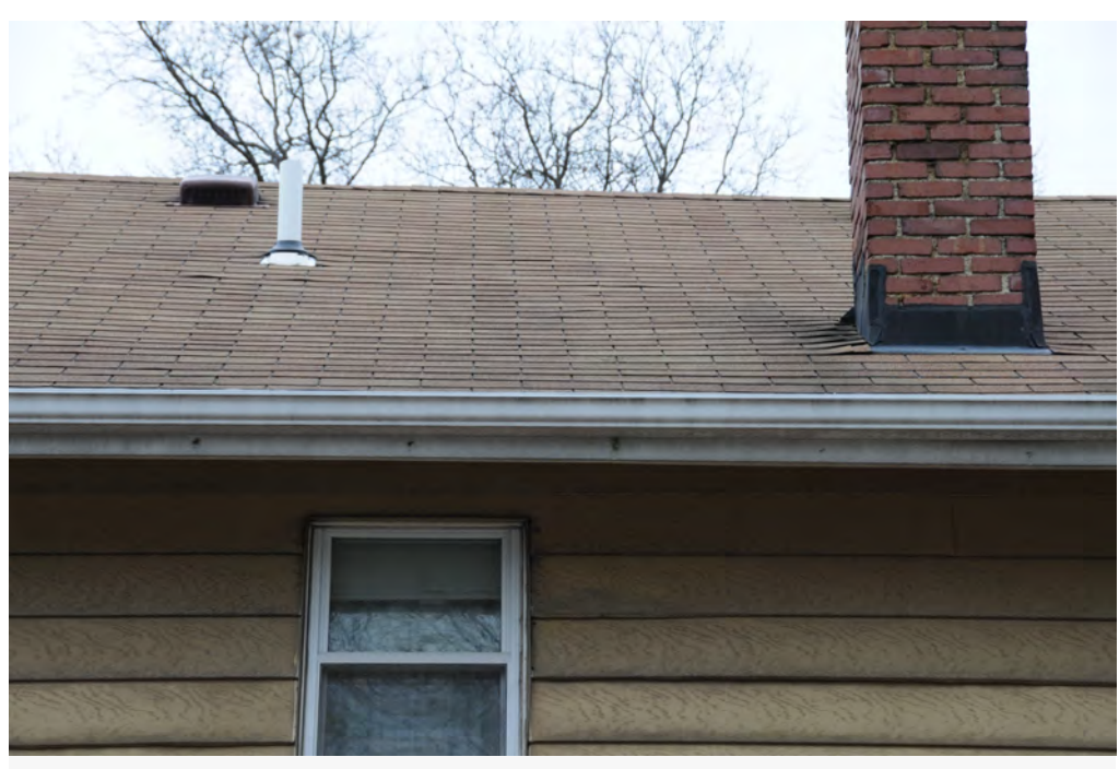
Figure 3, Overall photograph - 930 Dan St.

This document is the property of the Ohio Bureau of Criminal Investigation and is confidential in nature. Neither the document nor its contents are to be disseminated outside your agency except as provided by law - a statute, an administrative rule, or any rule of procedure.